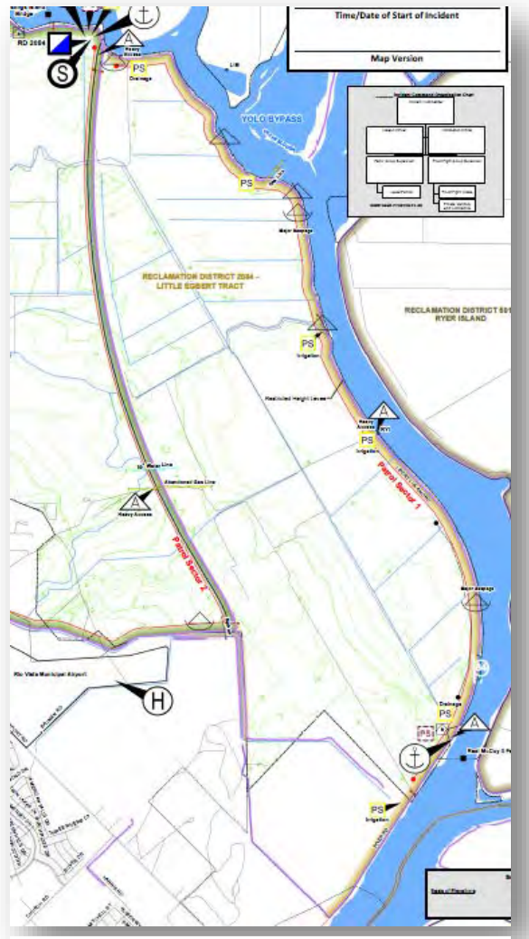
Figure 1 - RD 2084 Map

For more information, refer to the Solano County Local Hazard Mitigation Plan for a flood risk assessment. See Annex A for District jurisdictional boundaries, levees, pumping stations, supply depots, historical flooding summary, locations of past breaches and areas of historic